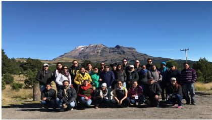
Participants of the EbA School during their field trip to Izta-Popo National Park

Adaptation is a key element of Mexican climate policy, which is reflected in the 21 adaptation actions defined in the country's NDC and Mexico's announcement to develop a National Adaptation Plan (NAP) at COP23. The country considers Ecosystem-based Adaptation (EbA) as a key approach to successful NDC implementation. Several IKI projects support Mexico's efforts to adapt to the adverse effects of climate change. Find out more: