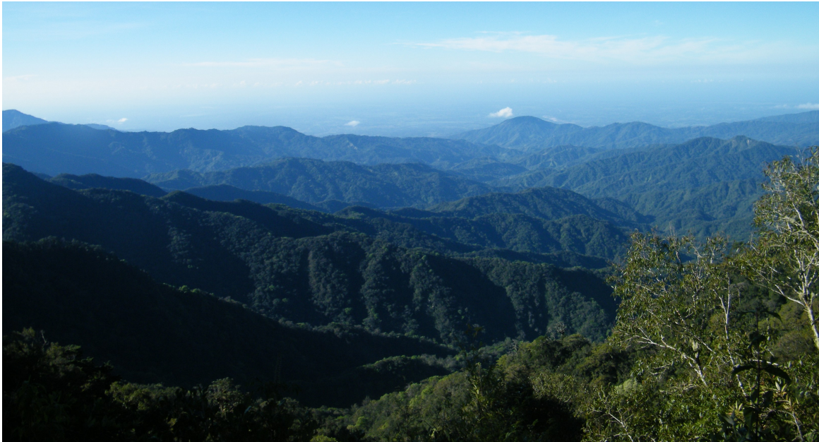
Biosphere Reserve “El Triunfo” in Chiapas

The Project “Multilevel Governance and Management of Carbon at a Landscape Scale” provides access to studies, articles and videos on MRV and multilevel governance to reduce emissions from deforestation and forest degradation (REDD+) in Mexico. Continue Reading