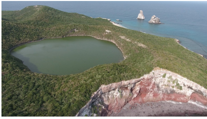
Isabel Island National Park in the Gulf of California

The BioMar Program has successfully completed a work plan that ensures a baseline of Ecological Scorecards for all Natural Protected Areas of the Gulf of California. The scorecards and reports contribute to the national objectives for fulfilling Aichi Target 11 of the Convention on Biological Diversity as well as Sustainable Development Goal 14: Life below water of the Agenda 2030. Continue reading