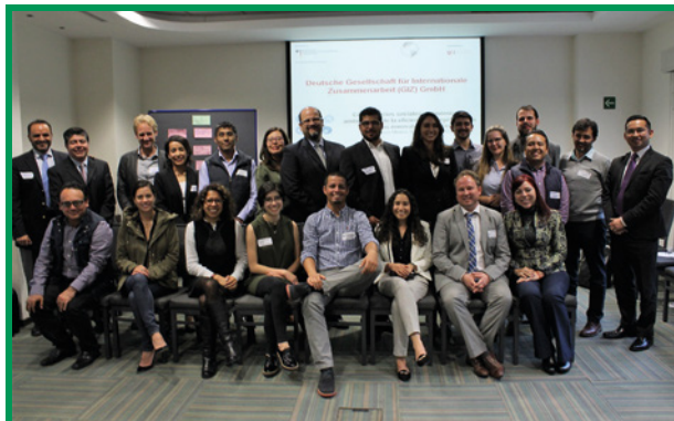
Participants of the kickoff Co-benefits workshop. 30th October 2018, Mexico City, Mexico.

on co-benefits in Mexico. This analysis helped identify the relevant actors for the organization of a kickoff workshop , a process of institutional exchange and multi-stakeholder dialog that looked to identify priority co-benefits for Mexico, on a national and local scale. The workshop took place on 30 th October 2018 , and more than 15 public and private sector institutions and NGOs took part.