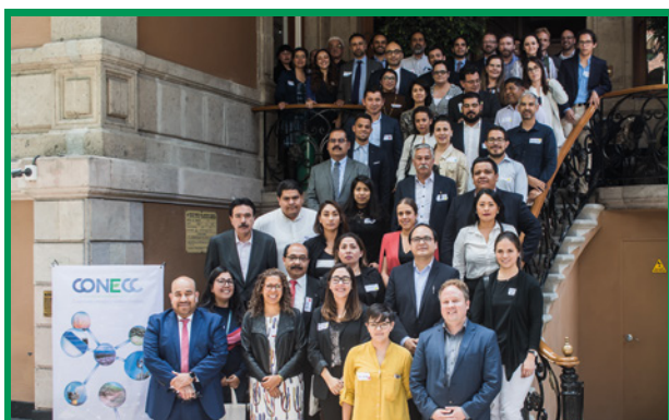
Participants of the national results workshop. 15th August 2019, Mexico City, Mexico.

Finally, the national results workshop took place on 15 th August 2019 to present the preliminary results of Co-Benefits Mexico, with significant participation from the public sector – at the state and local levels – as well as from academia, research institutes, and private sector representatives. The workshop enabled the design of public policy options, and the qualitative aspects of the co-benefit studies were strengthened.